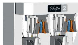
2 Hot Stations With Airbag