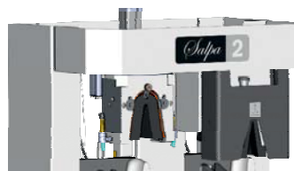
1 Hot - 1 Cold Station With Wipers (Flanging)