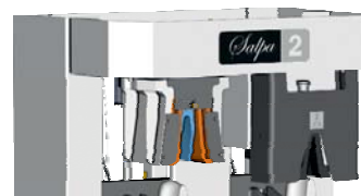
1 Hot - 1 Cold Station With Airbag (no Flanging)